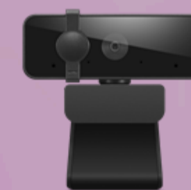
Lenovo 310 FHD Webcam Black GXC1S15024

Please click here to view the full list of accessories.