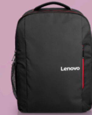
Lenovo 16" Laptop Everyday Backpack B510 4X41U80414

Please click here to view the full list of accessories.