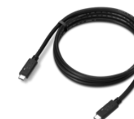
Lenovo USB 20Gbps USB-C to USB-C Cable 1.5m 4X91U92143