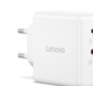
Lenovo Dual USB-C 65W GaN Charger GOA6065WEU