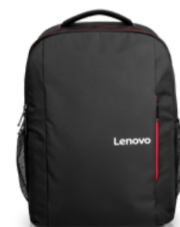
Lenovo 16" Laptop Everyday Backpack B510 4X41U80414