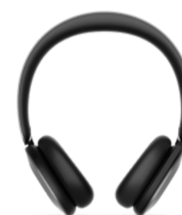
ThinkPad Dual-Mode Wireless ANC Foldable Headset 8550 (Aura Edition) - USB-A,... 4XD1V23301